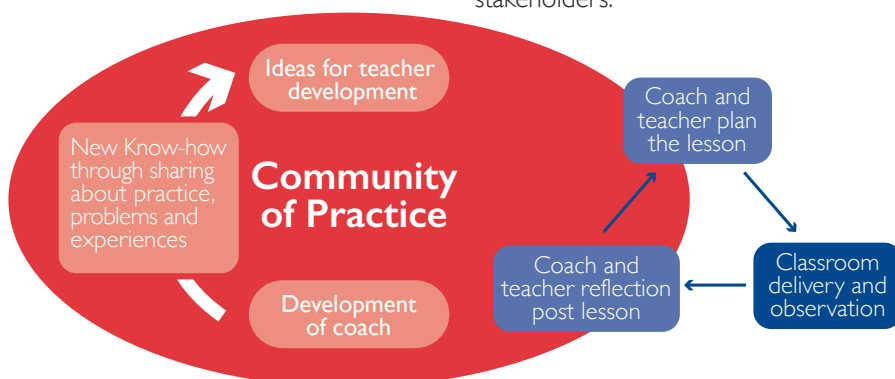
Teacher coaching model – adapted from EDT

The diagram below shows the concept of teacher coaching models.