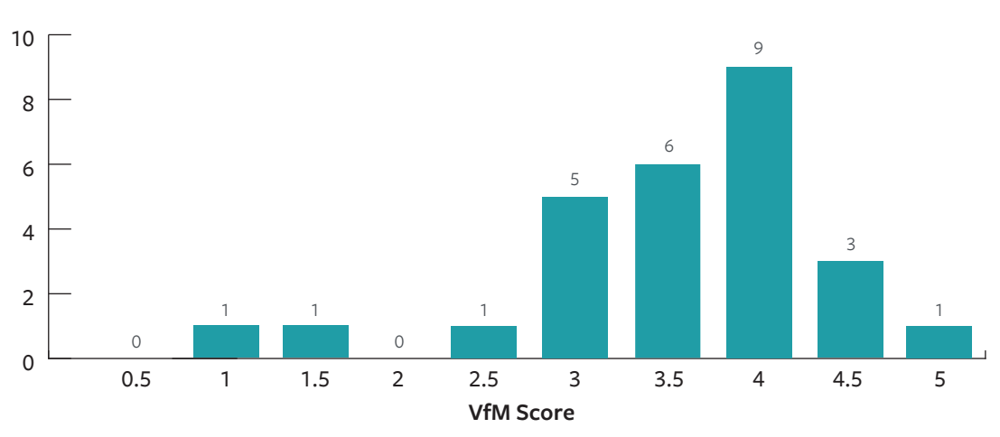
Figure 4: Illustrative summary of VfM scores across the portfolio for 2021