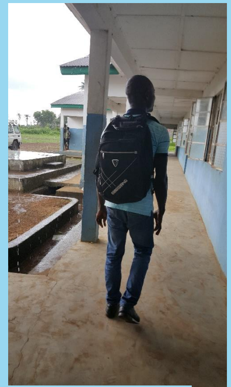
A male teacher at school

"Male teachers wouldn't do anything and sometimes they flog in their office."