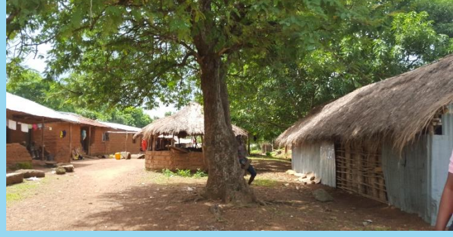
Trees in the community

Multiple girls chose to take photographs of fruit trees, explaining that the reason for this was that they or their families would sell the fruit in