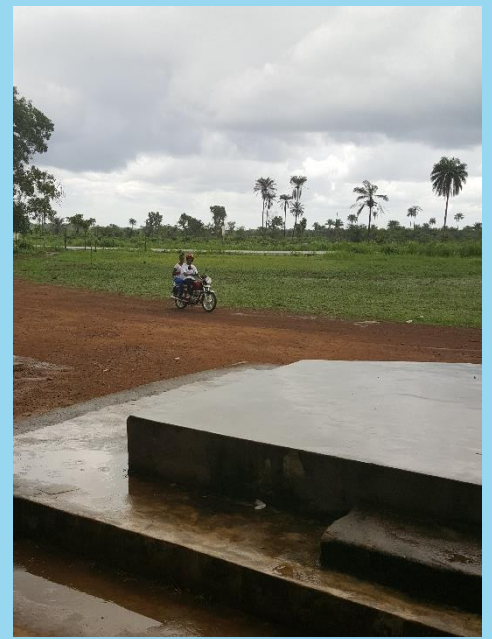
Transport to school

Girls were thankful for the existence of motorbikes in the community that they could use to travel to school, expressing gratitude through phrases like "Praise the bike!". However, when this theme was