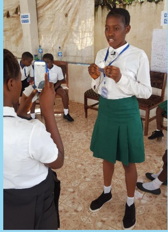
Filming a piece to camera

Girls used smartphones and lapel microphones to record each other as they spoke about their photos, speaking in Krio, their mother tongue, throughout.