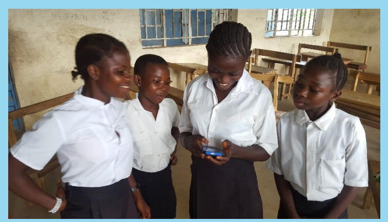
Girls experiment with the cameraphone

The girls, many of whom had not previously used smartphones, had the opportunity to familiarise themselves with the technology, including the photo and video recording functions, before going out to their schools and communities in two groups to take photos that told a story their experience about of education.