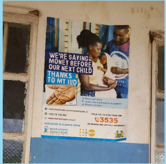
SRHR information at school

There was often a lack of agency associated with the girls' sexual and reproductive experiences, and many knew friends or classmates who had previously been forced to drop out of school due to pregnancy. Girls also