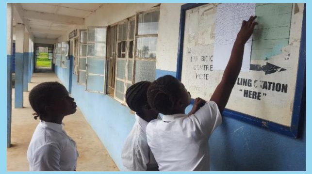
Inspecting the noticeboard

Information was framed as something that needed to be sought out, rather than something that was freely given, and the girls were removed from decisions that directly affected them.