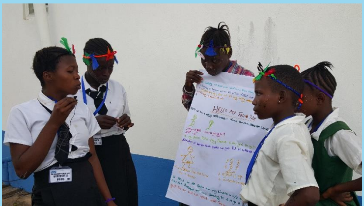
Girls broadcast their newsflash

Participants start by working in groups pretending they are a 'local news team' with the