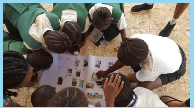
Girls crowd around their photos

There are no right or wrong answers in this process, which allows participants to explain why they are grouping or coding stories in certain ways. Participatory analysis is a for powerful tool groups to collectively surface and integrate multiple perspectives and CO-