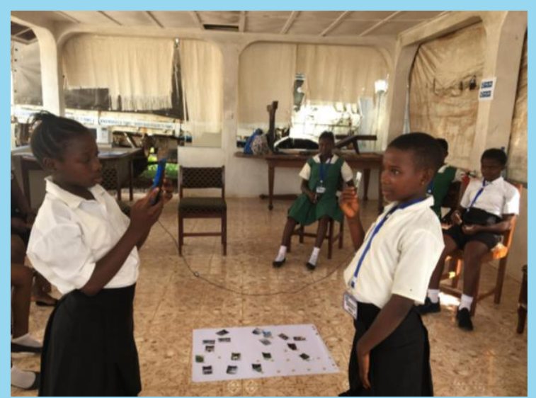
Girls interview each other about their photos

The peer-to-peer questioning used as part of this process meant that the issues and themes that emerged were explored from the perspective of the individuals who experience them. rather than from an external viewpoint. This added power to the analysis led by the girls because it was unfiltered and unmediated by outsiders; it spoke to a lived experience rather constructed than а narrative.