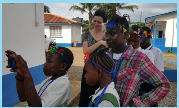
Girls film a newsflash

Drawing a path down a large piece of paper, the groups were challenged to think about how they would convey this journey to their audience and which aspects they would want to share. Along the path, they can then note down points of learning, knowledge or issues that will help the audience travel from the starting point to a place of deeper knowledge and understanding.